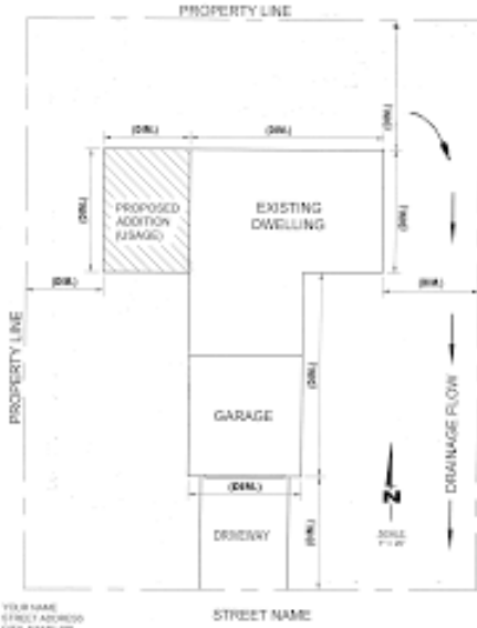
RESIDENTIAL ADDITION PLOT PLAN EXAMPLE